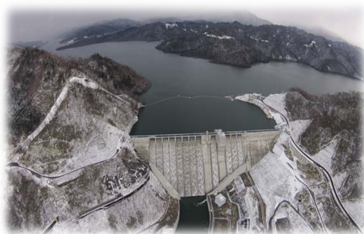
Rendering of the Yubari-shuparo Dam