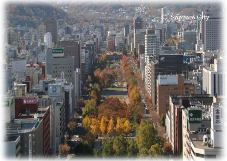
Sapporo Ohdori Ave. Park