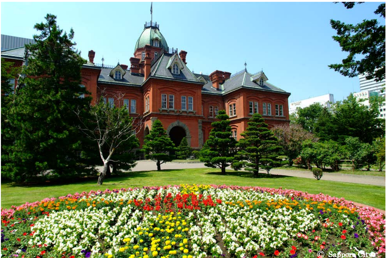
Old Hokkaido Government Office Building