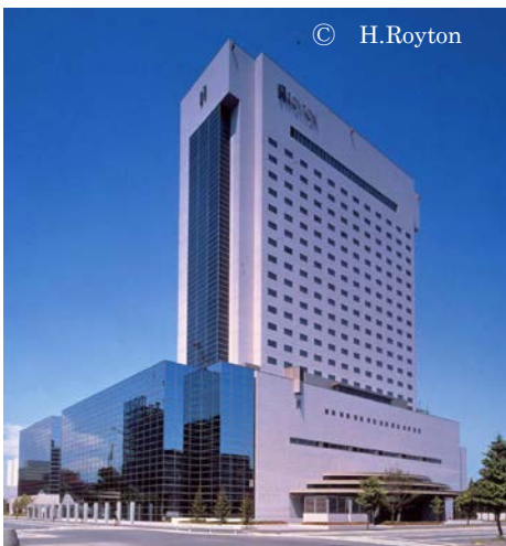
The Hotel Royton